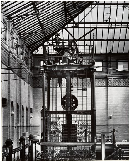
Title: ? Artist: Dosso Dossi