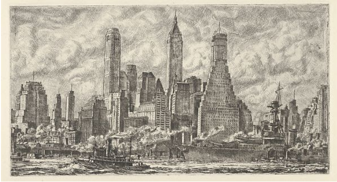
Title: ? Artist: Julio Le Parc