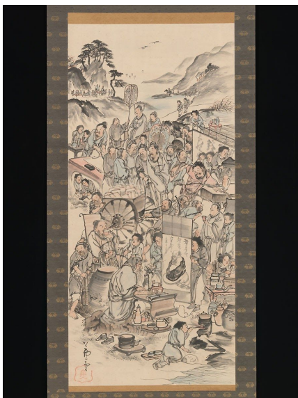
Title: ? Artist: William Anastasi