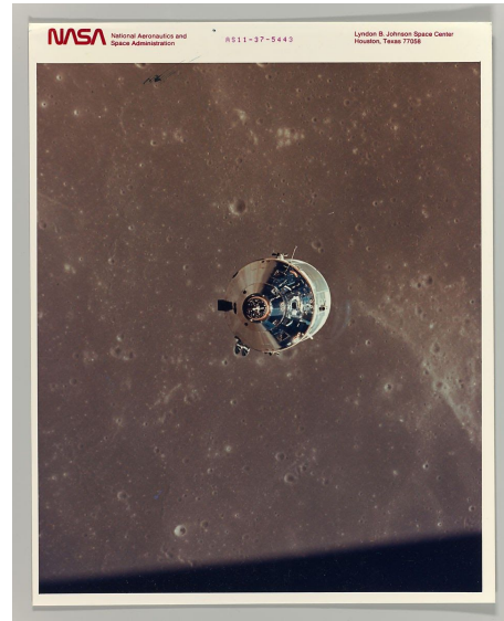
Title: ? Artist: Follower of Nagasawa Rosetsu