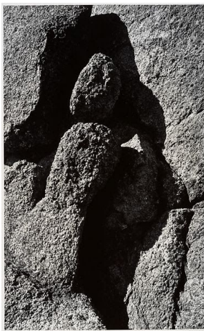
Title: ? Artist: Harold Edgerton