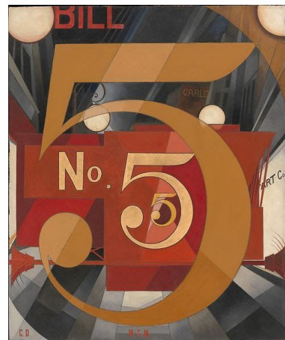
Title: ? Artist: Aaron Siskind