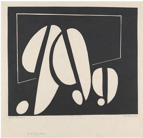
Title: ? Artist: NASA