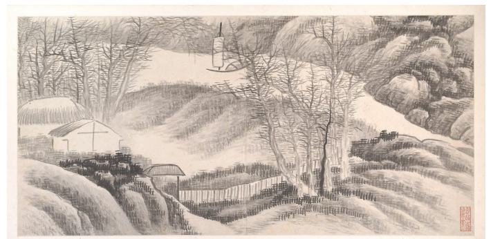
Title: ? Artist: Reginald Marsh