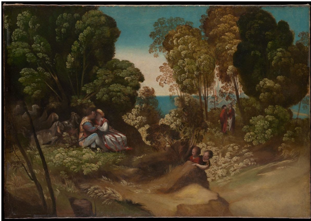
Title: ?! Artist: James Welling