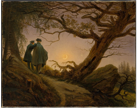
Title: ? Artist: Charles Demuth