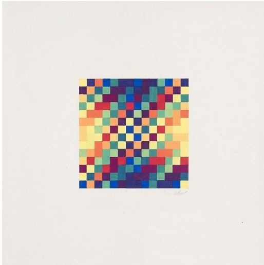
Title: ? Artist: Thomas Rowlandson

Oh no! A thief has broken into the Met, and tampered with seventeen works of art! While you're fixing all the artwork, what should the Met get to stop this from happening again? -----