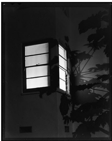
Title: ? Artist: Elihu Vedder