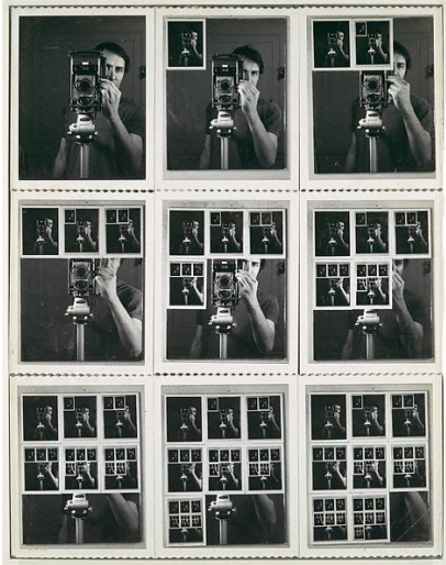
Title: ? Artist: Caspar David Friedrich